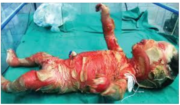
Fig. 1: Harleguin Baby