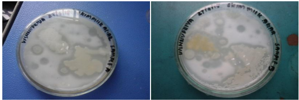
Fig. 1: Screening of protease isolates on skimmed milk agar